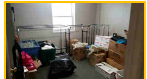
Above: The spare room full of donated clothing racks, hangers & boxes. Below: Volunteers smile in the new ‘boutique.’