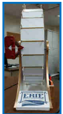
Top Left: A side view of the wheel displays its glitter numbers & colors + the custom dry erase marker and eraser holder.