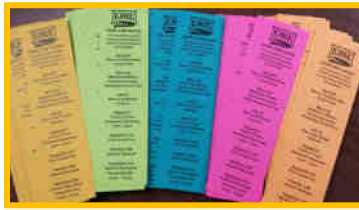
Fun 2016 bookmarks! *Available at ECBDD