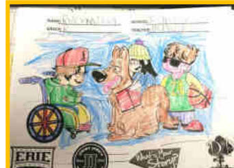
Ryley: Kindergarten @ Furry