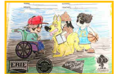
Lauren: 2nd Grade @ SCCS